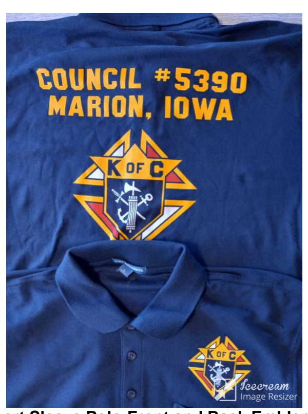
Short Sleeve Polo-Front and Back Emblems