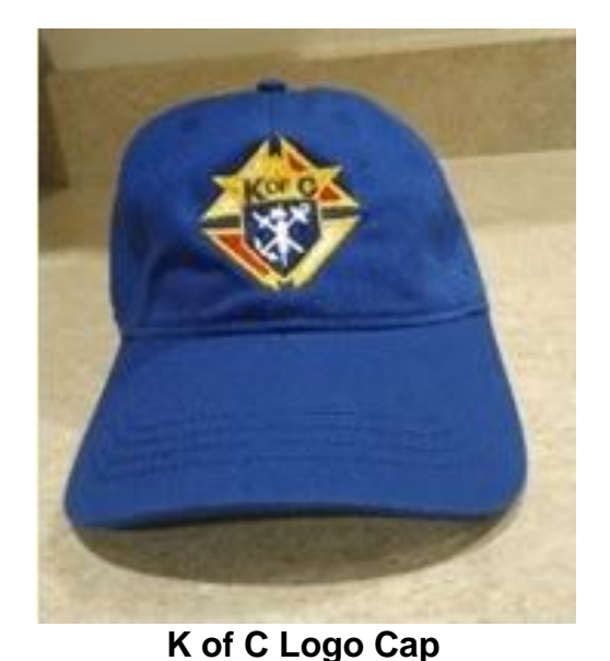
New Apparel Prices:

Gray Tee-Shirt for Utility Activities: $27.00 Short Sleeve Polo for Utility or Dress: $40.00 Shirt for Dress for Dress Activities: $25.00 Low Profile Adjustable Cap: $15.00