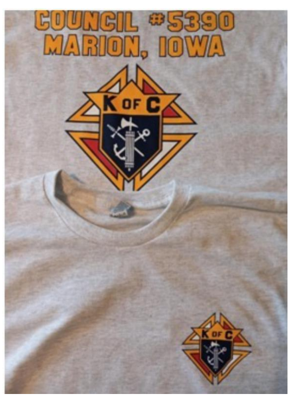
Short Sleeve T-Shirt-Front and Back Emblems