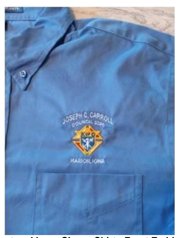
Short and Long Sleeve Shirts-Front Emblem