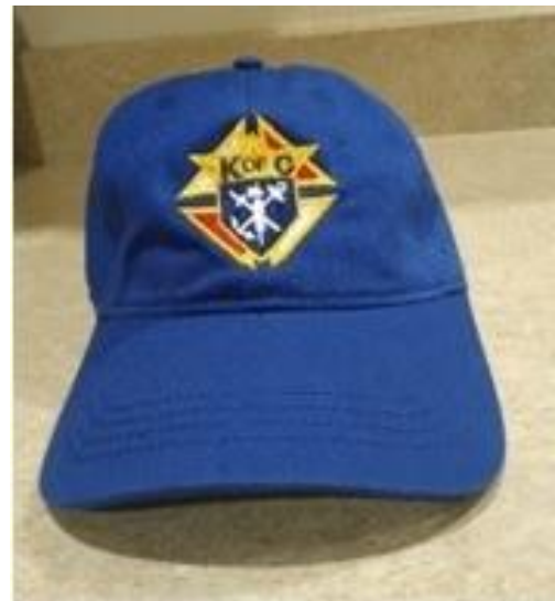
K of C Logo Cap