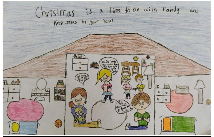
GRADES – 5 & 6 HAILEY KETTMANN