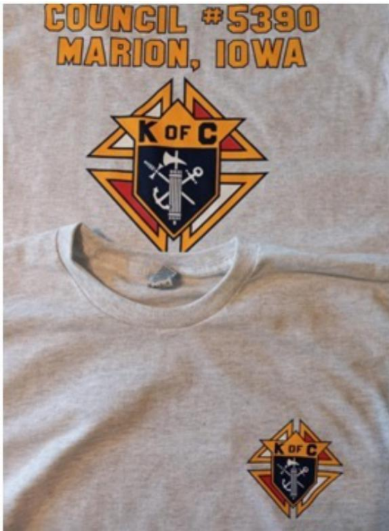
Short Sleeve T-Shirt-Front and Back Emblems