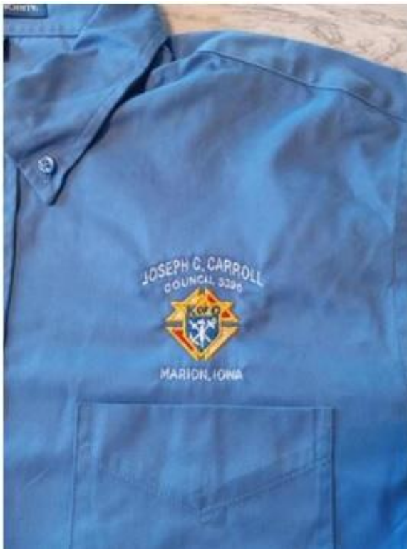
Short and Long Sleeve Shirts-Front Emblem