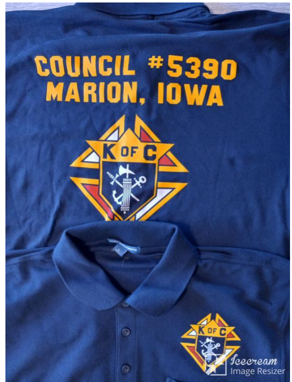
Short Sleeve Polo-Front and Back Emblems