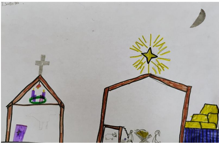
GRADES 1 & 2 – ISABELLA ATKINSON